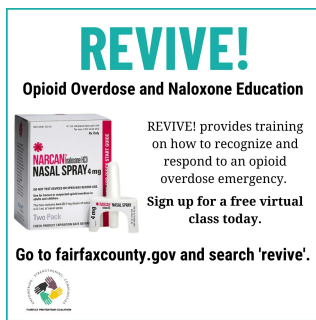
Opioid Overdose and Naloxone Education Trainings

Please save these images and share on social media. Help us to share information throughout the community.