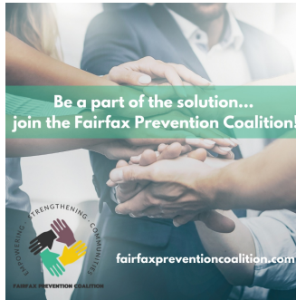
Join the Fairfax Prevention Coalition