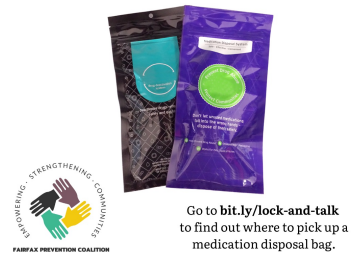
Safe Disposal of Medications

Pick up a medication disposal bag today.